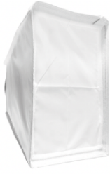
6x8 Softbox FLXP3-6x8SB